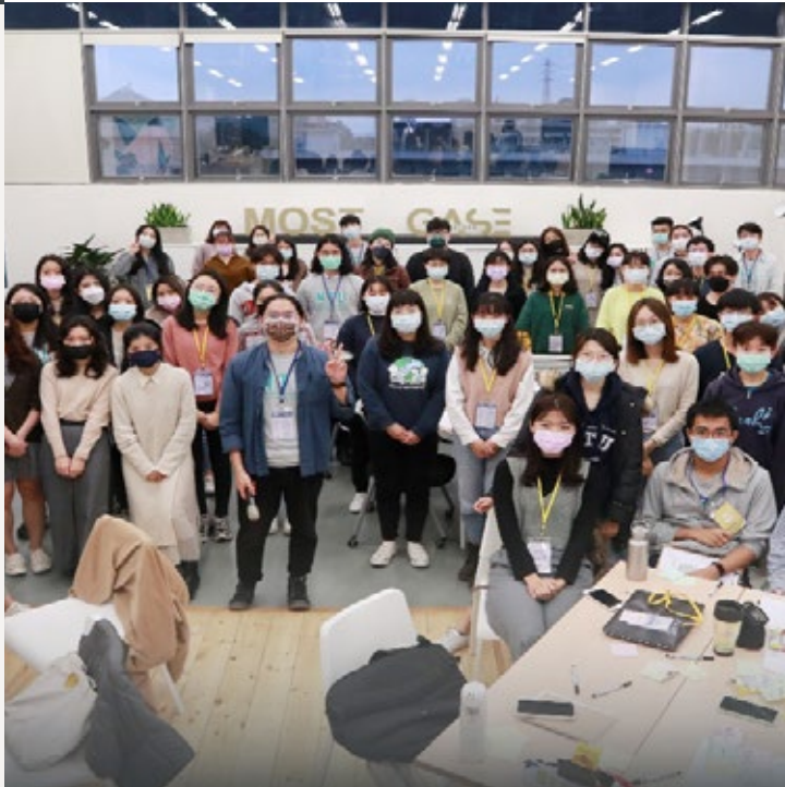
培璘人才培育計畫 - 設計思考工作坊