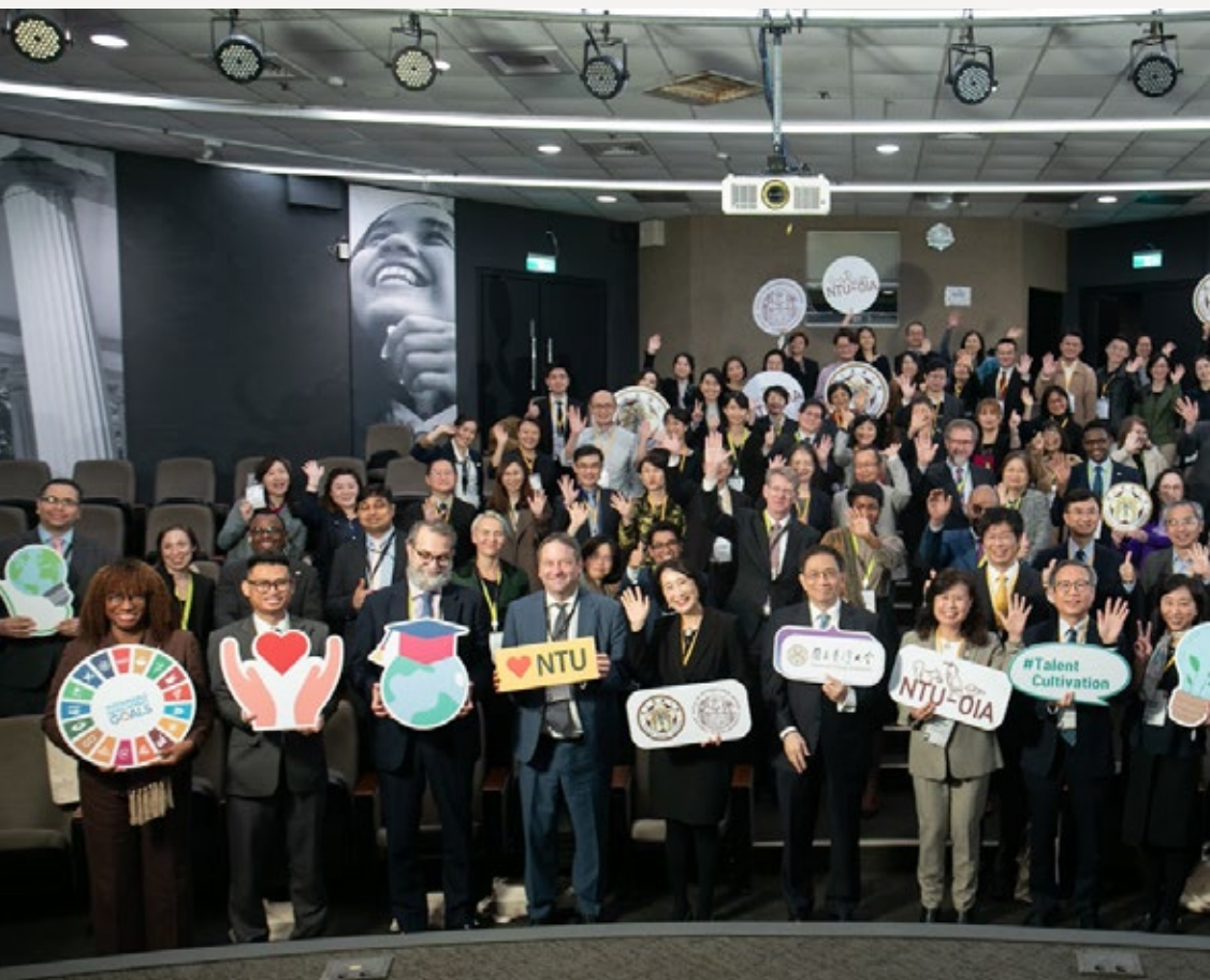
臺大駐臺代表高峰會 NTU Summit of Foreign Representatives in Taiwan